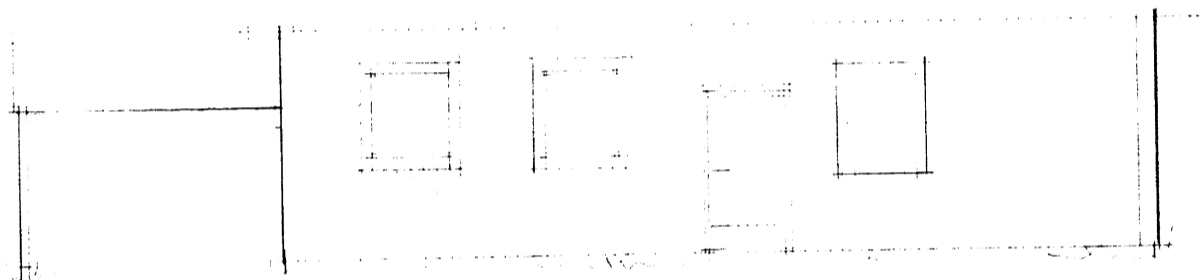
FACAL MOT SÖDÖST